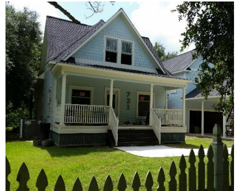
The Captain Meyer Home

The 2 nd floor had to be removed and was reconstructed to meet city codes and windstorm guidelines. Its restoration took three years. The original façade of the home was recreated along with three gables matching the roof's original pitch.