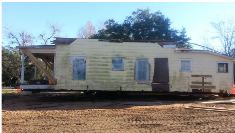
Meyer Home being moved to it's new location in 2013.

The home also now permanently hosts a woodpecker in another column.