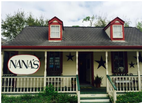
Nana's Attic – Founders Square

There are no records of the home's journey from Dickinson to League City, but the area where it was housed, has an interesting history. The rural neighborhood included Hall Street, north of the Dickinson city limits and north of the intersection of 20 th Street East (formerly Hall Street) with California Street. In the early 1960's, the site was used for the unpermitted disposal of chemical waste dumped in shallow pits or on the ground.