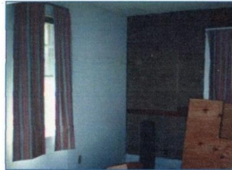
An original interior room.