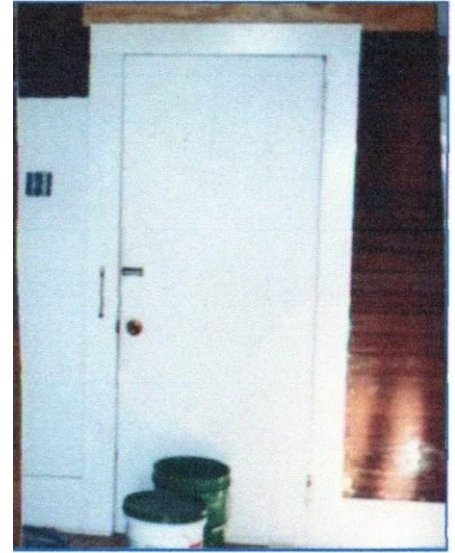
The original entry.