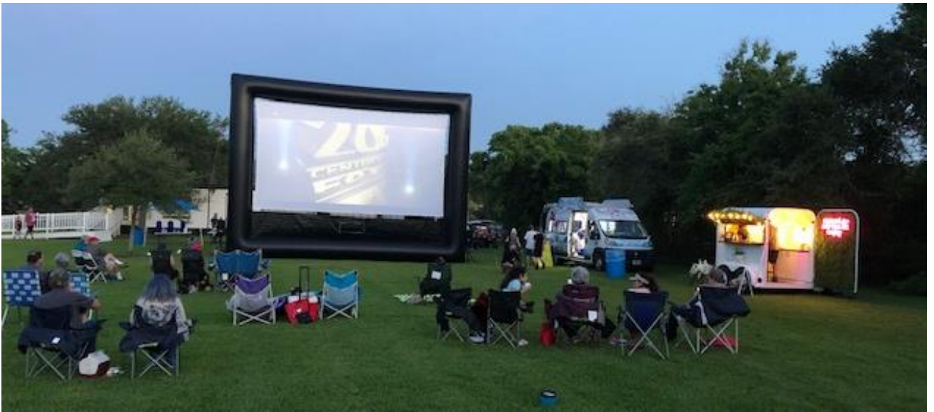
Above: Last Friday night there were movies in the park at Butler Long Horn Museum!

*For City of League City scheduled events check the City website, City Matters and other social media sources.