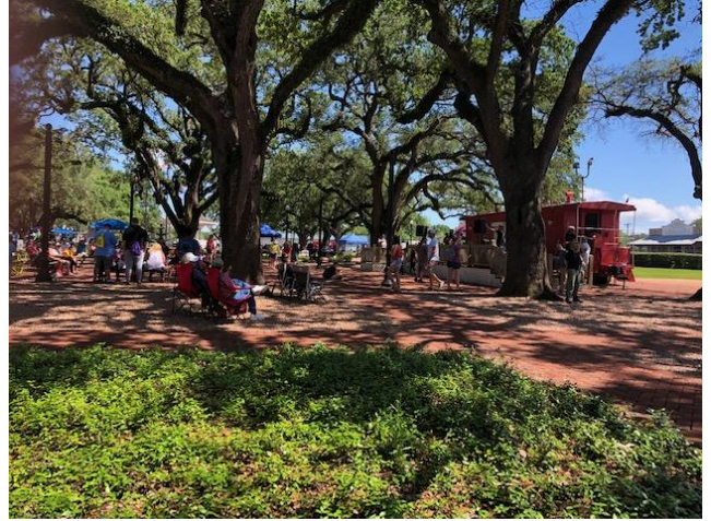
Above: Lots of people are enjoying the Sunday events in League Park!