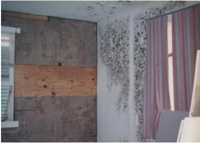
The original bedroom

Below are photos of the original Arolfo home before it was restored and became what is now Nanna's Attic.