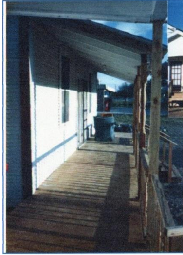
The original porch.