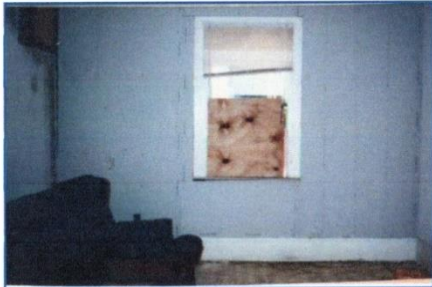
The original living room.