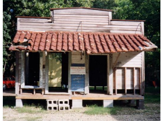
Before picture of little 12x18 business on the museum property