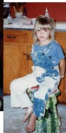
Little boy on stool in barber shop Top half a boy, bottom half a girl.