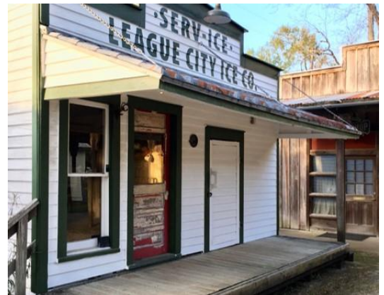
The Icehouse after restoration.

The icehouse restoration included ghostlike figures who electronically tell the City's history with the push of a button. These figures were made from men born in League City and all except the children have passed on.