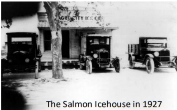
The Salmon Icehouse in 1927