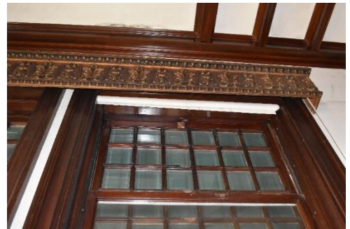
Hand beveled glass transoms.