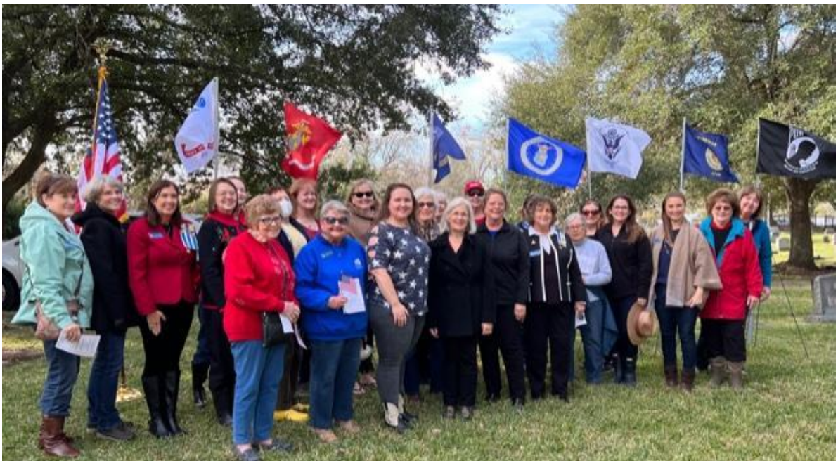
Pictured above: Members of Sam Houston Chapter, NSDAR during the 2021 Wreaths Across America.