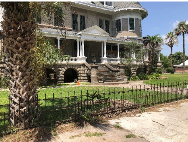
Above: The JC League Home in Galveston.