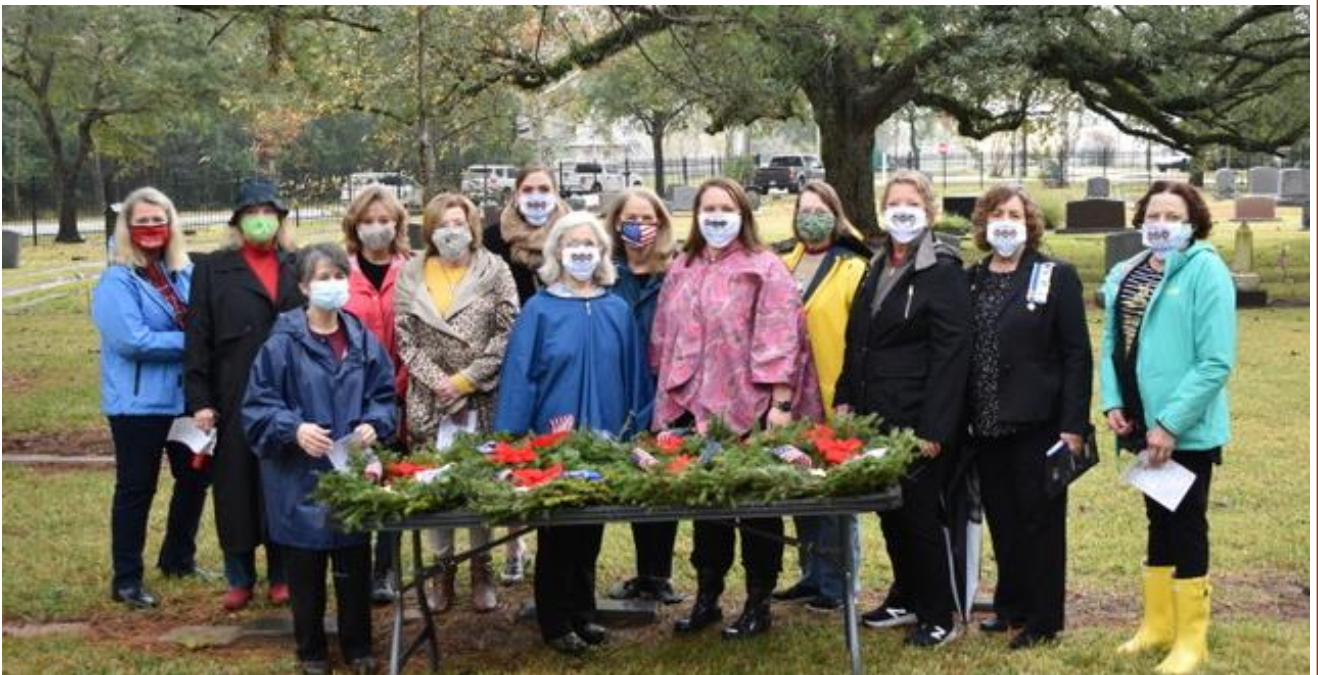
Members of Sam Houston Chapter, NSDAR.

Thank you for helping us remember and honor all our brave heroes.