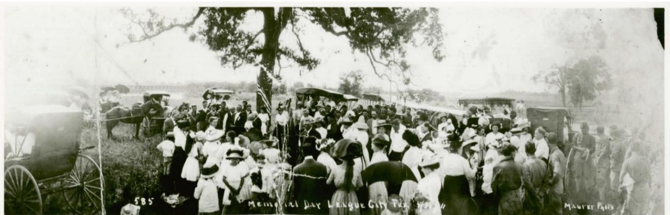
Above: Clear Creek Bridge Fairview Cemetery - Memorial Day 1911.