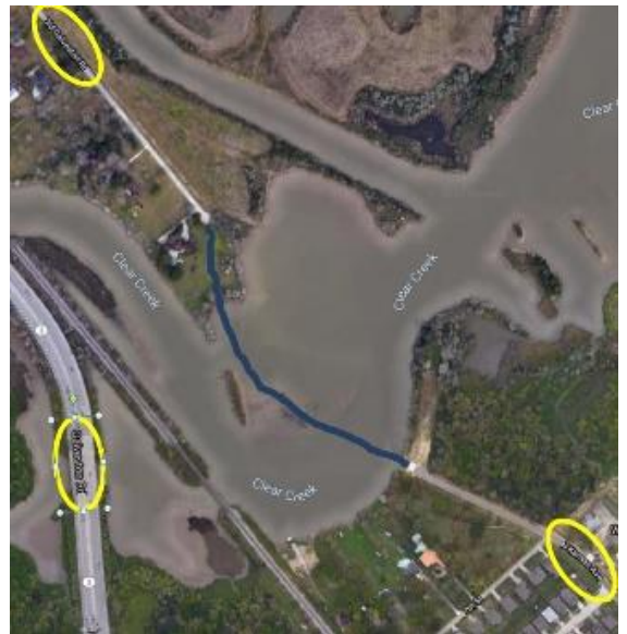
Above: Old Galveston Road via the old Clear Creek Bridge.