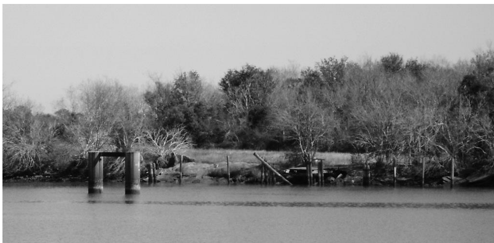
Above: Clear Creek Bridge Iron Remnants

(Canoes Horses and a Bridge - continued from previous page.)