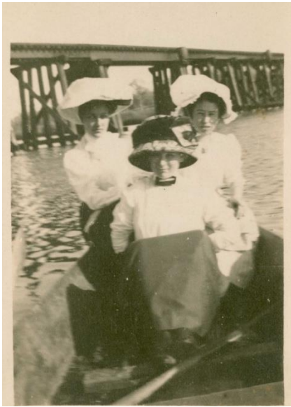
Left: Three women near the bridge at the end of Kansas Street.