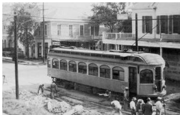
Above: Galveston Houston Interurban