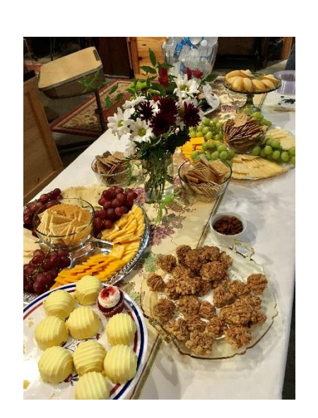
There was good food, too!