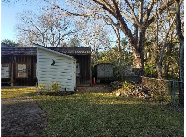
Picture above: The "Gypsy Hut" which is located behind our Barn Museum. Picture right: Shows the sturdy 35 year roofing material Richard Lewis and Ed Preston installed on our little Gypsy Hut which is so important for needed extra storage space.