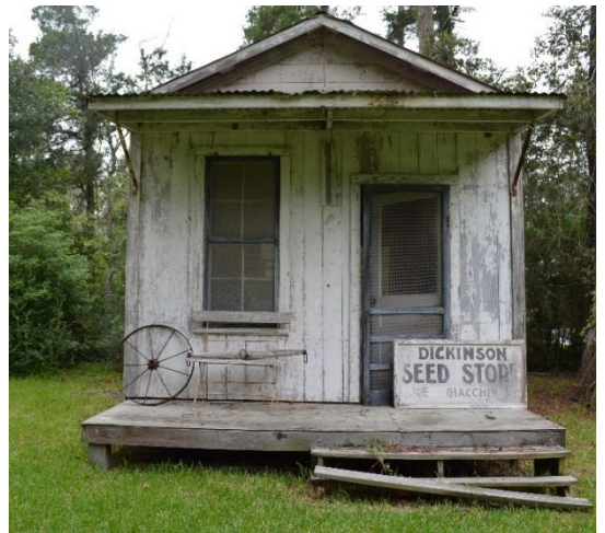
2013 Color photo by Joyce Zongrone LCDR Joyce Zongrone, USN (Ret)