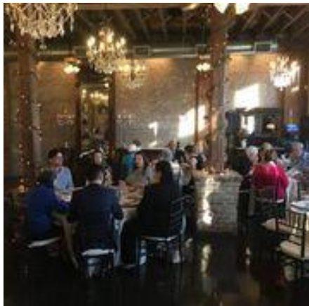
Living History Dinner 2019