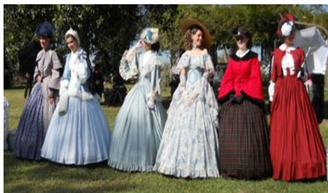
Victorian Ladies @ 2015 Homes Tour