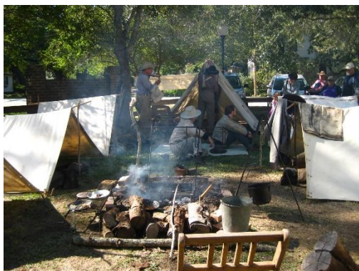
Visitors enjoyed watching the Texas Infantry in action as they encamped on our LCHS/WBCS school grounds - 2011.